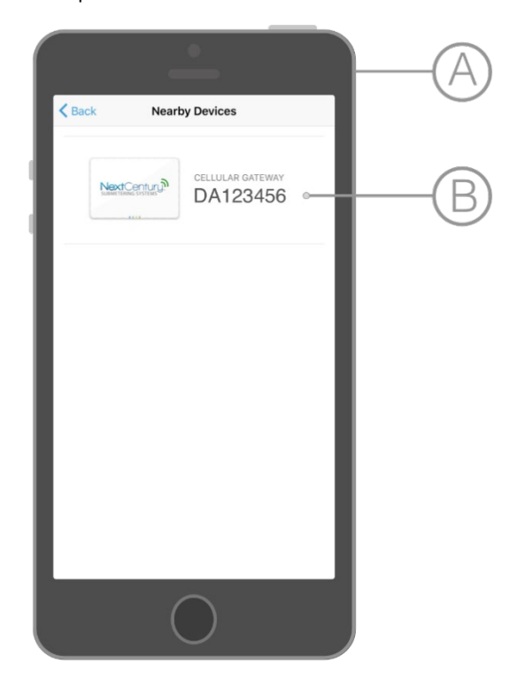
Figure 3 Viewing Nearby GW-301 Using NCSS Mobile App A The NCSS mobile app is available for Android or iOS devices. B Nearby devices can be selected in order to establish a direct