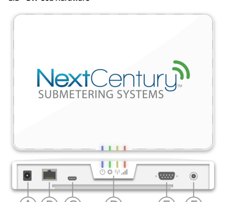
Figure 1 GW-301 Hardware

A 15 VDC Power C USB Port E 3<sup>rd</sup> Party Port B Ethernet Port D LED Indicators F Antenna Connection